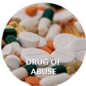
DRUG OF ABUSE